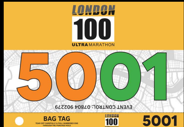
Colour coded bibs correspond to route ribbons